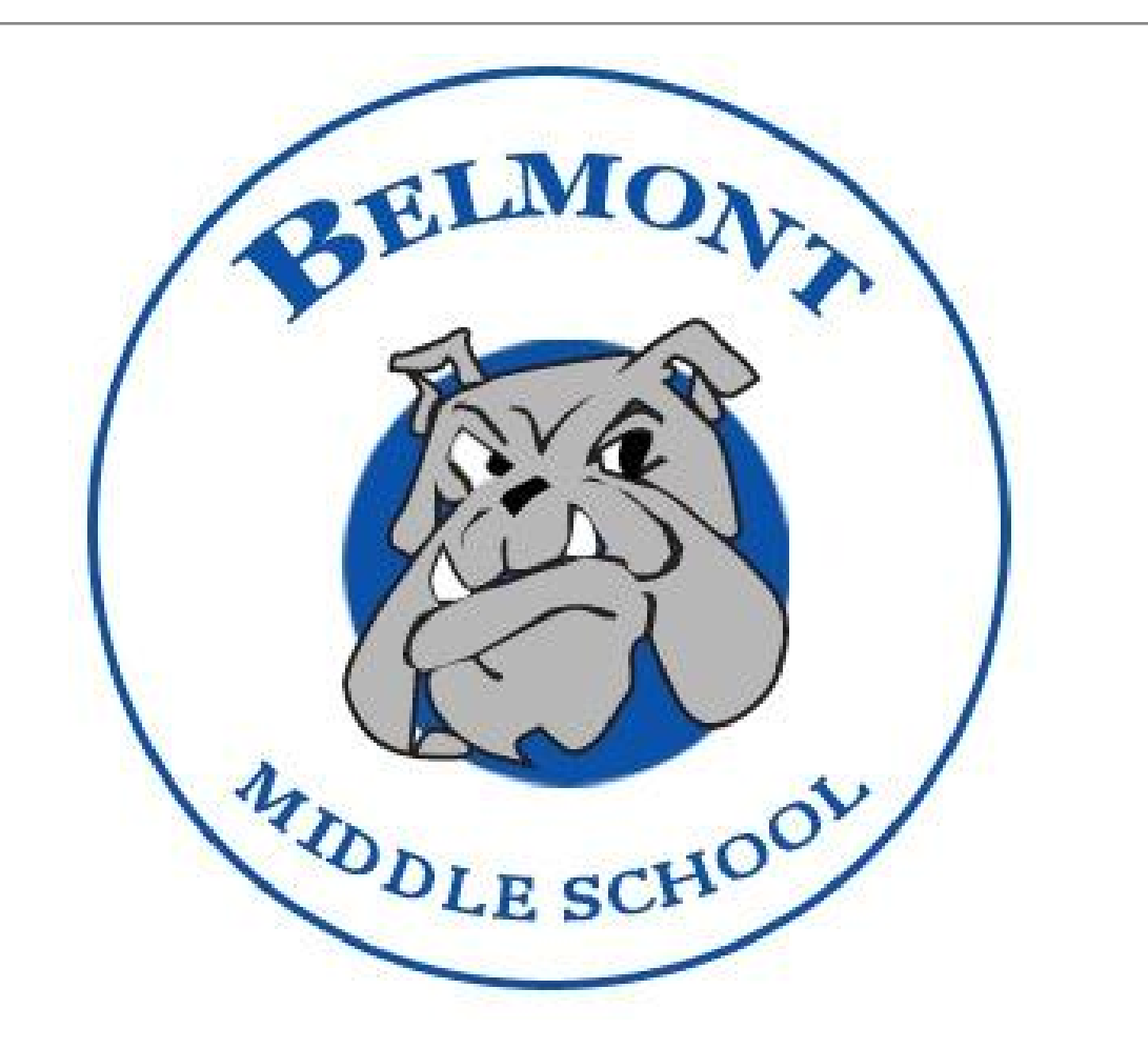
Belmont Middle School athletics focuses on learning athletic skills, game rules, fundamentals of team play, socio-emotional growth, and sportsmanship.